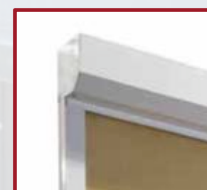
White case with side channel