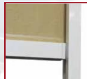
White hardware detail with weighted bottom hembar