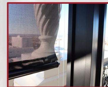
Dark Bronze hardware with cable guide.